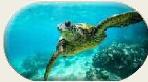
Caretta-Caretta at Alagadi Beach Watch their journey to the sea