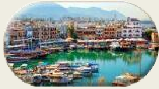
Old Harbour In Kyrenia Historical Harbour, Captivating view