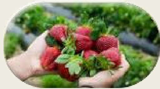
Strawberry Fields In Yedidalga Taste the fresh fruit harvest