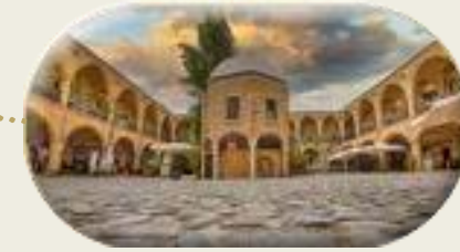
Büyük Han in Nicosia Vibrant local markets, cultural interactions