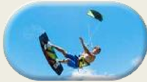
Kite Surfing in the West Year round kite surfing excitement