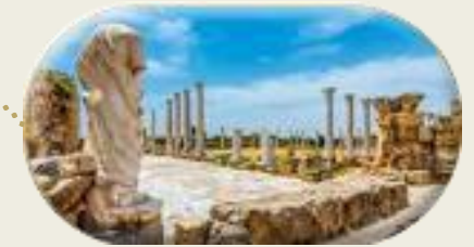
Famafusta Salamis Ruins Remnants of the Ancient Roman City