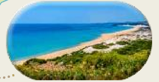
Golden Beach Cleanest sand, untouched beauty