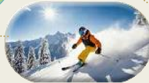
Trodos Dağları'nda kayak Kış sporlarının da tadını çıkarın!