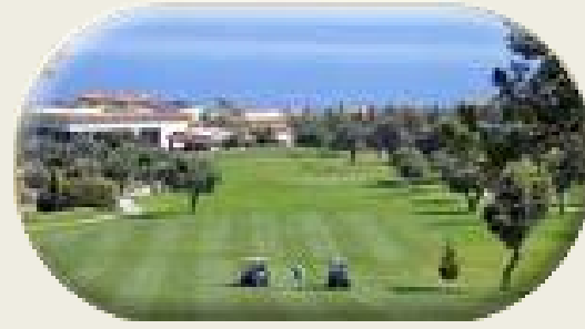
Korineum Golf Cluv An elite golf resort nestled in the tranquil landscapes